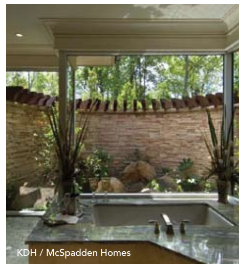
KDH / McSpadden Homes