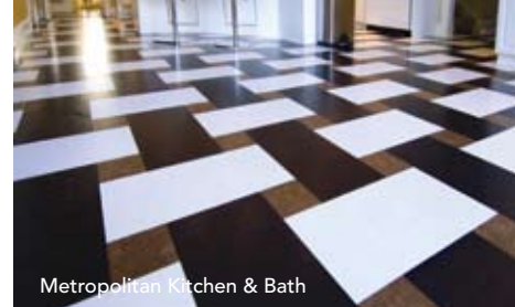
Metropolitan Kitchen & Bath