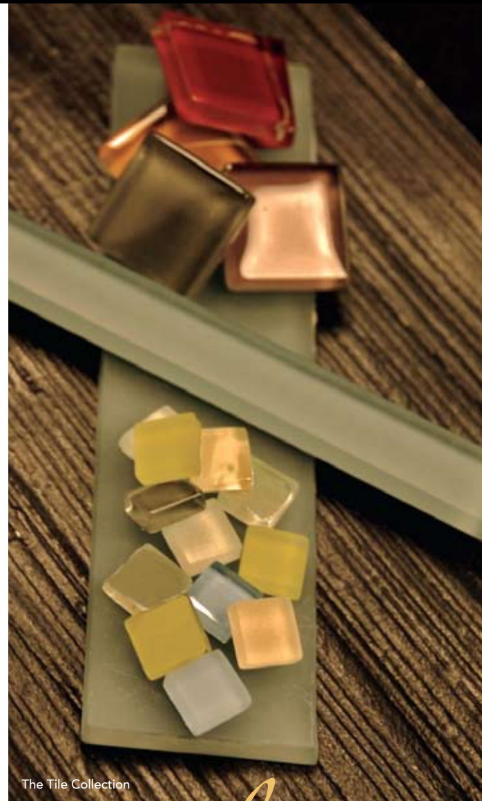
The Tile Collection