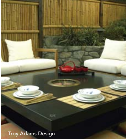
Troy Adams Design

More natural homes are meant to feel good and live well while reflecting both nature and the homeowner. The bottom line for a warm, natural home: Create a space that works for you.